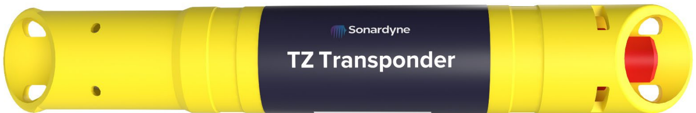
Type 8365-0002 (with RFID tag)

The Type 8365 Transition Zone Transponder (TZT) is designed to work with Sonardyne's TZ/OBC acoustic positioning system and enables the positions of seismic hydrophone positions to be accurately and efficiently determined.