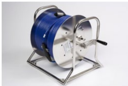
100 m Cable drum