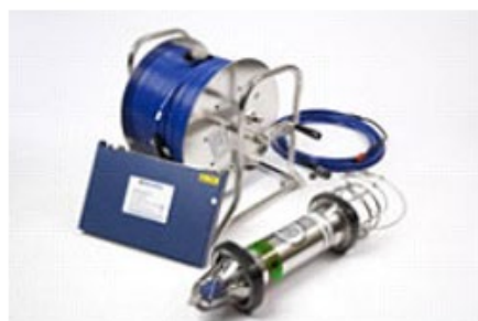
Cable drum, SIU and Dunker