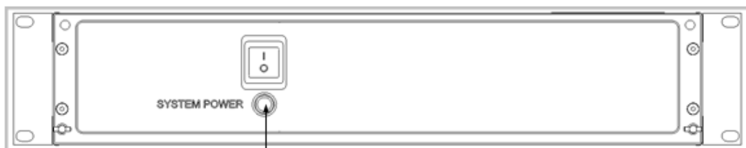
System Power On Indicator (Red)