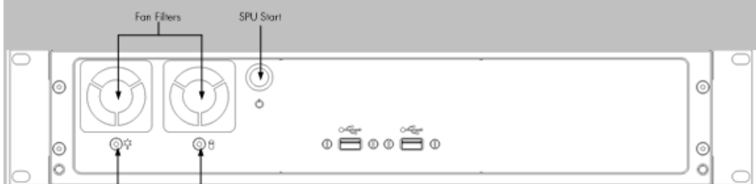
SPU Power Indicator