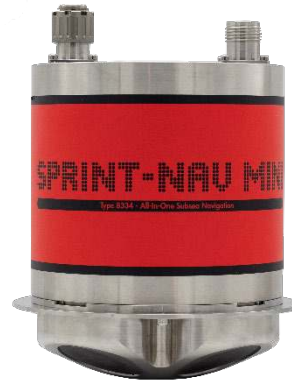
SPRINT-Nav Mini 4,000 m