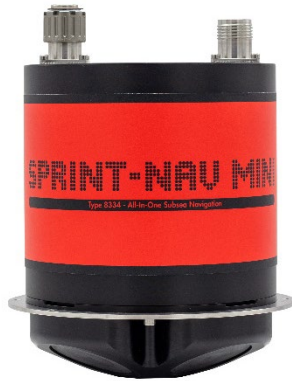
SPRINT-Nav Mini 300 m