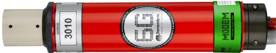
Modem 6 Mini 8244-3111 Omni-Directional